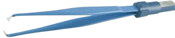
Bipolar multifunctional forceps, inside angled, length 130 mm, wide 3 mm