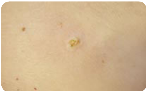
Right after treatment