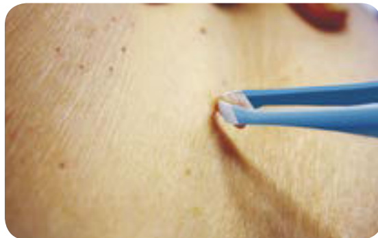
The pendunculated wart or fibroma pendulans is held at the base with the forceps, and is separated from the skin by means of coagulation effected by a pulse trigger over the footswitch.