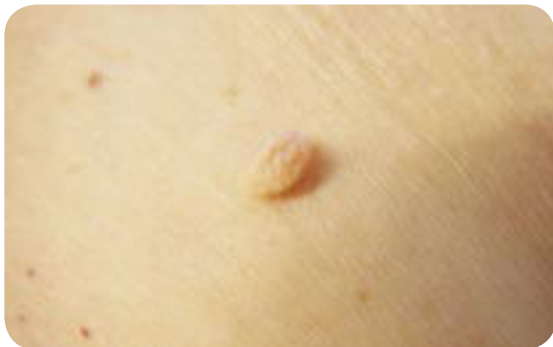
No local anaesthesia is required.

During removal of the pendunculated warts or fibroma pendulans no cutting is required and a surgical suture is no longer necessary. The treatment is bloodless and does not result in any scars.